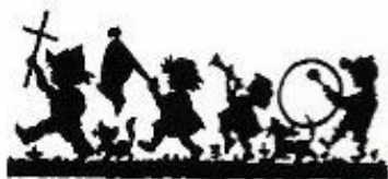
Holy Comforter Episcopal School

Thanks so much for your help and for allowing our young ones to experience the joy of helping those who are less fortunate!