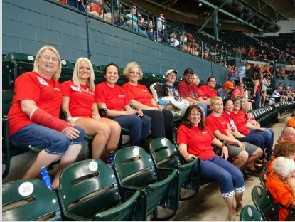
The gang's all here.