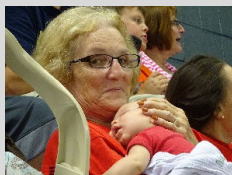
Don't wake The baby.